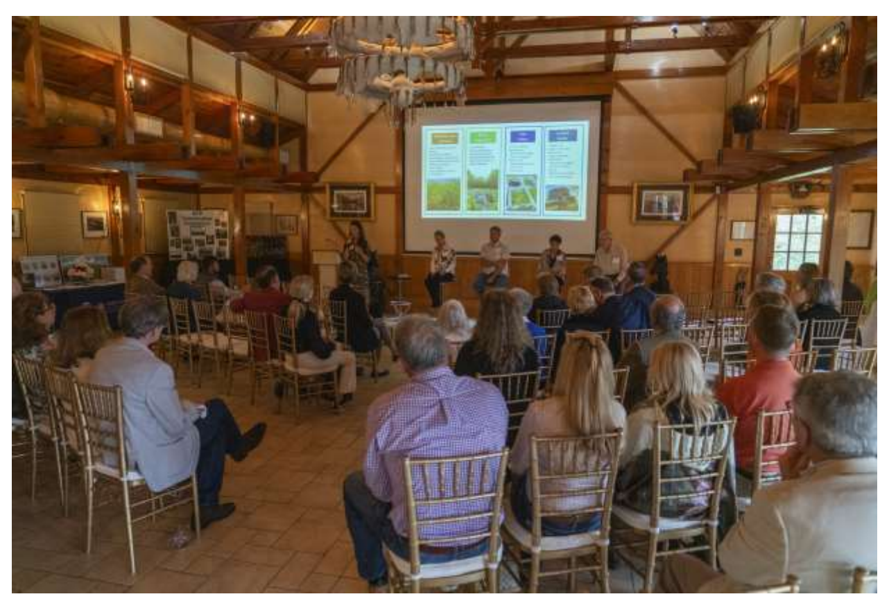
Many landowners in the OCHCF Territory attended the panel and learned about conservation practices they might implement on their own properties.

A panel of VWL network landowners and leaders in stewardship shared their conversation practices and advice with attendees.