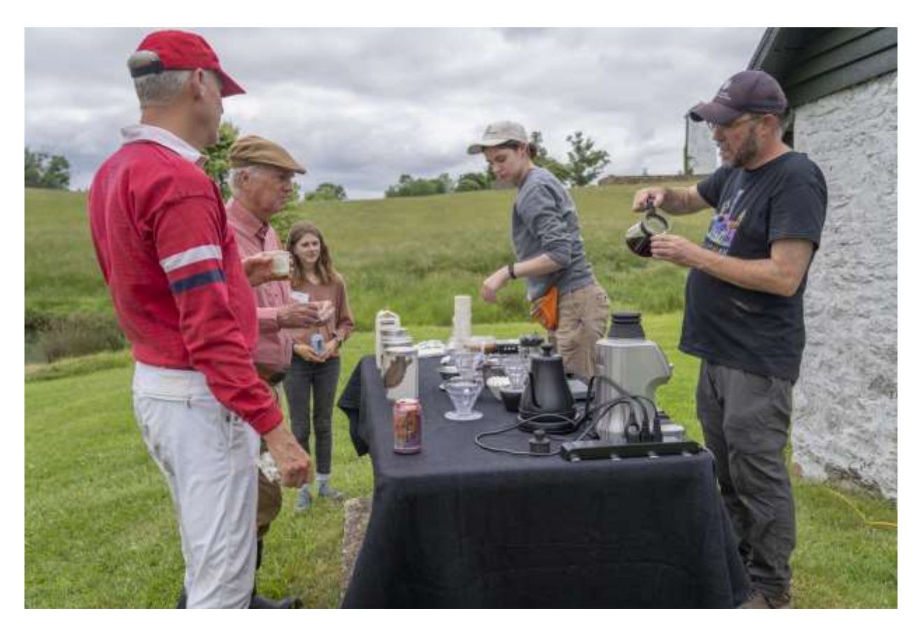
The event concluded with time to mingle, enjoy snacks, and participate in a bird friendly coffee tasting!